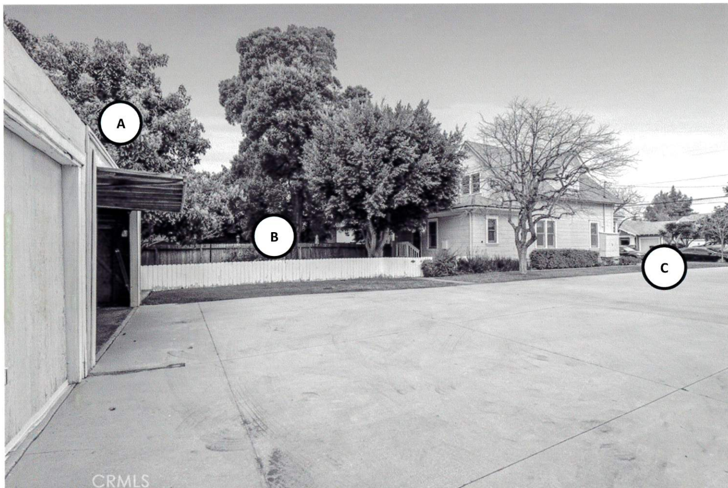
SIDE OF HOUSE (2 OF 2)