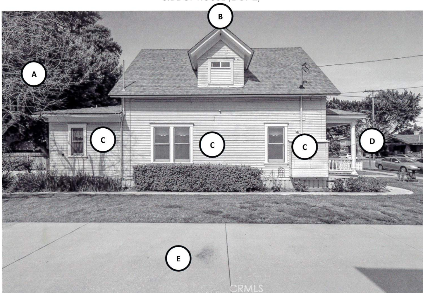
SIDE OF HOUSE (1 OF 2)