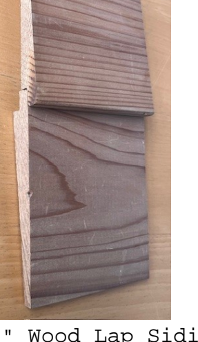
7" Wood Lap Siding (For Accessory Structure)