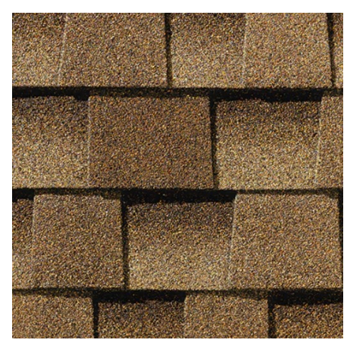
5.Roof Shingles Timberline HD in "Shakewood"