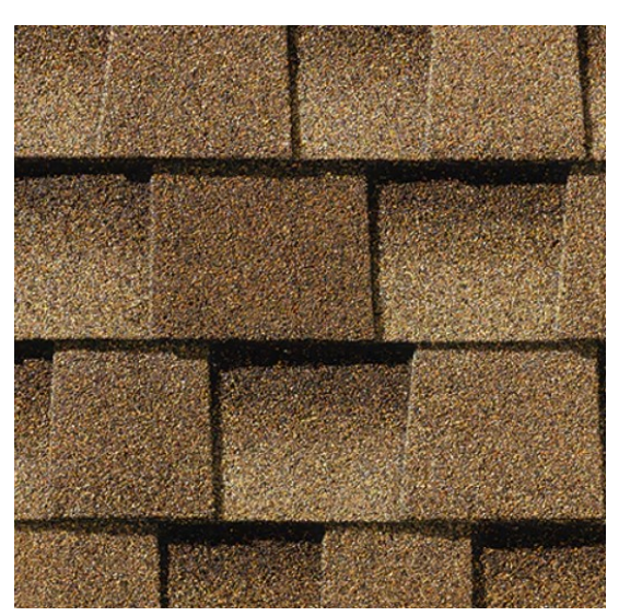
5.Roof Shingles Timberline HD in "Shakewood"