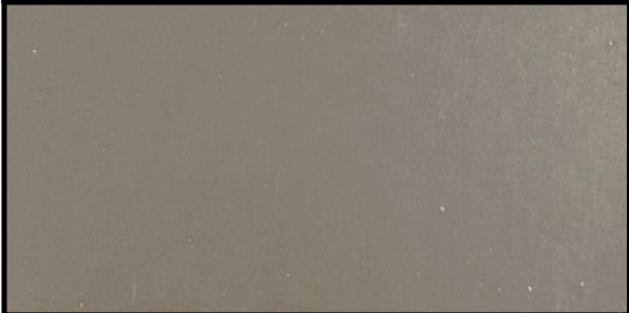
2, 5 & 6. STOSIGNATURE, COLOR: MBCI SIG. 200, BURNISHED SLATE