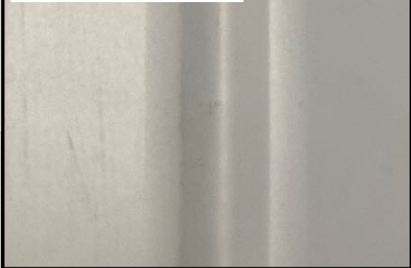
2. BATTENLOK H6 METAL ROOF