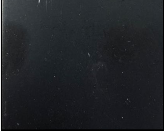
3 & 4. COLOR: MATTE BLACK