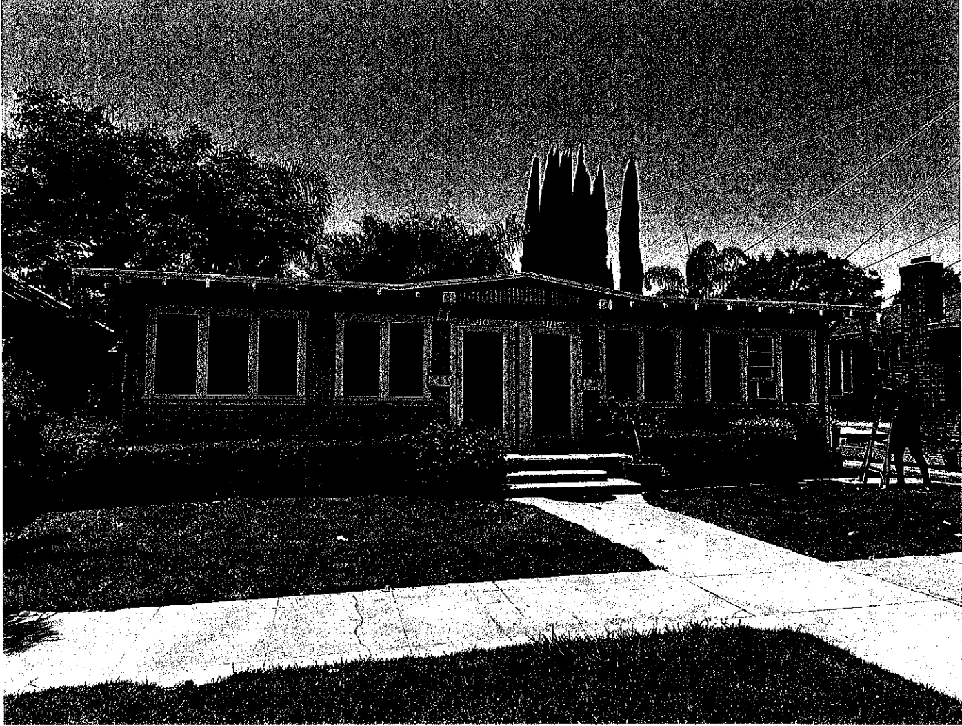
Front Elevation Facing West