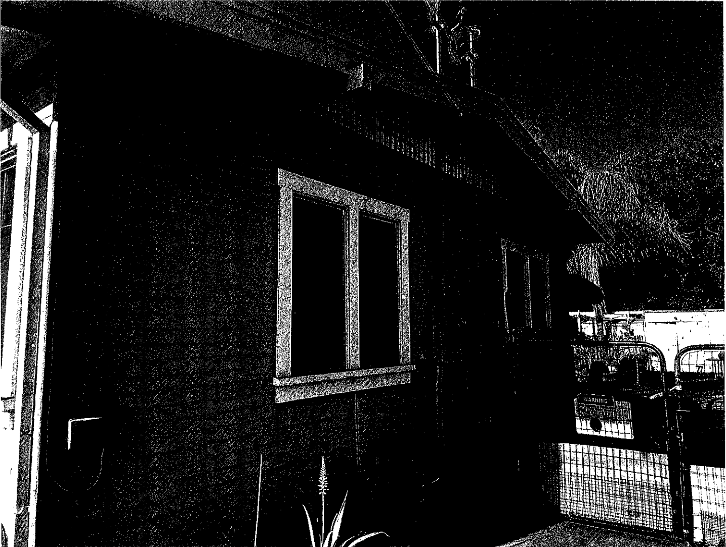
Side Elevation Facing South