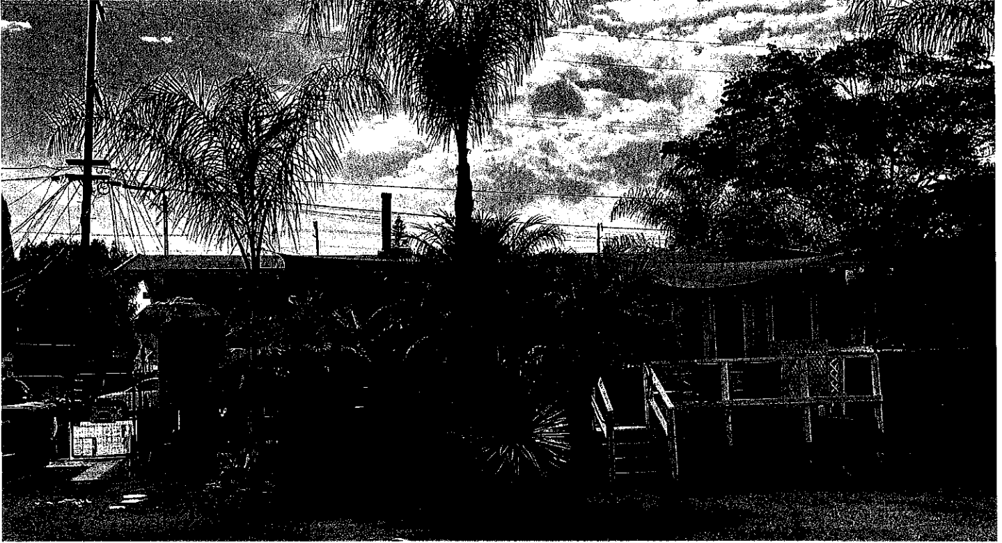
Rear Elevation Facing East