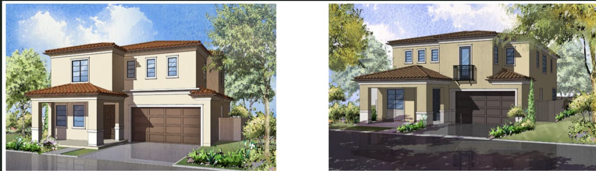
Rancho Ridge Planned Unit Development (Pending)