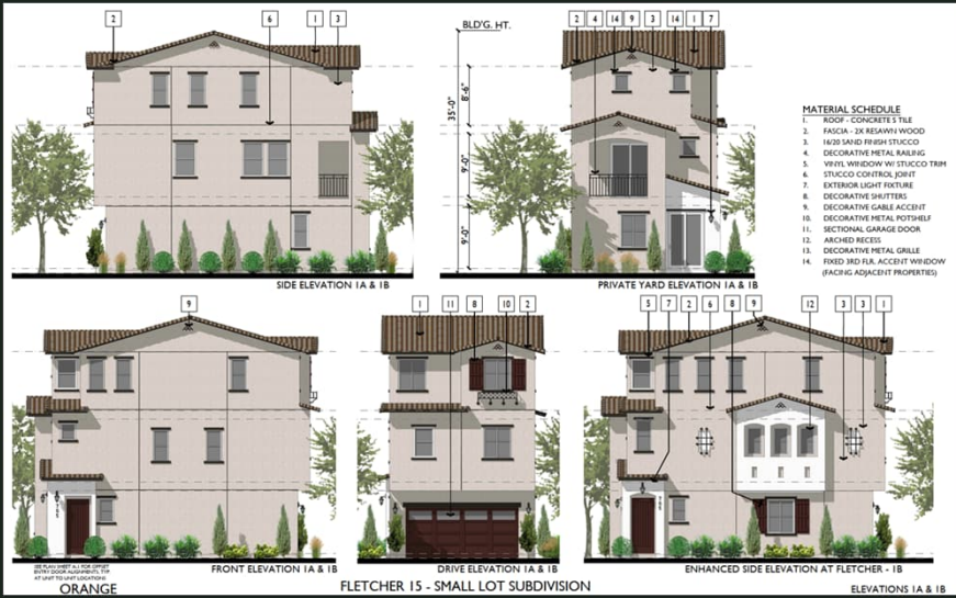
Fletcher 15 Small Lot Subdivision (Approved)