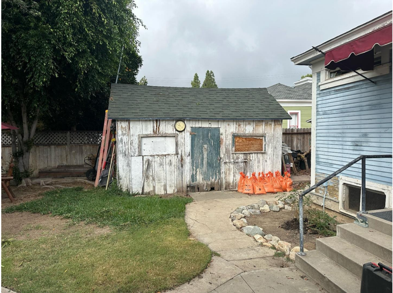
View looking east.