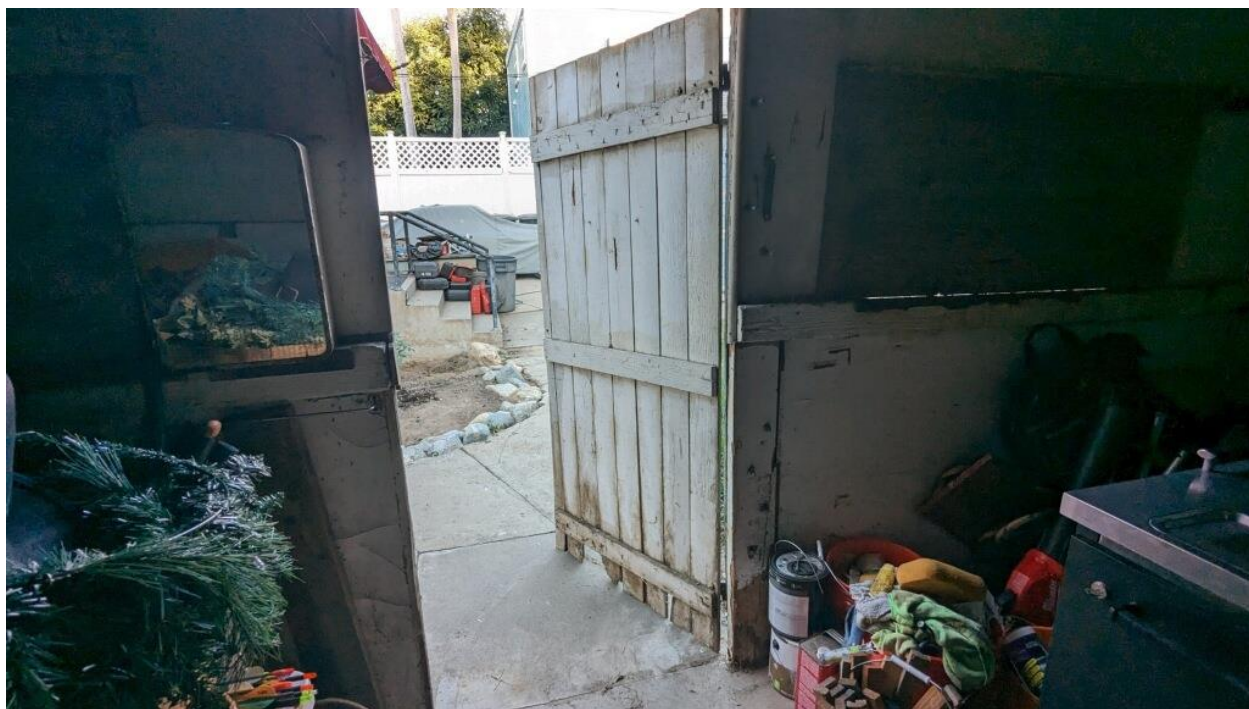
View looking east, interior