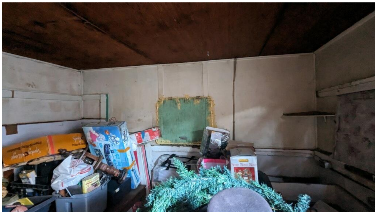
View looking north, interior.