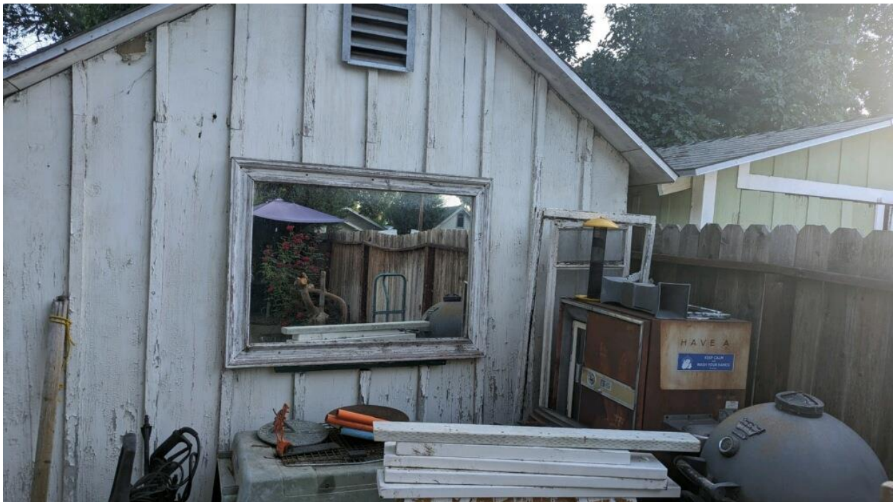
View looking southwest