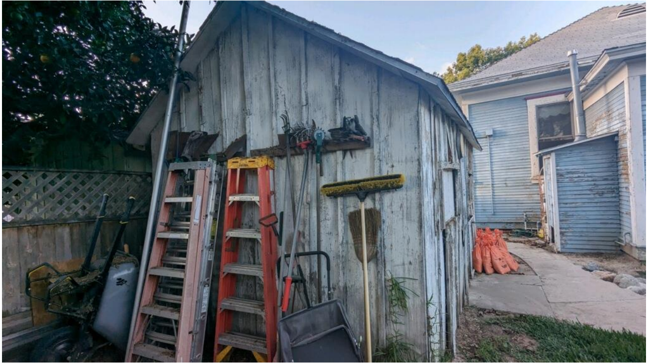
View looking northwest.