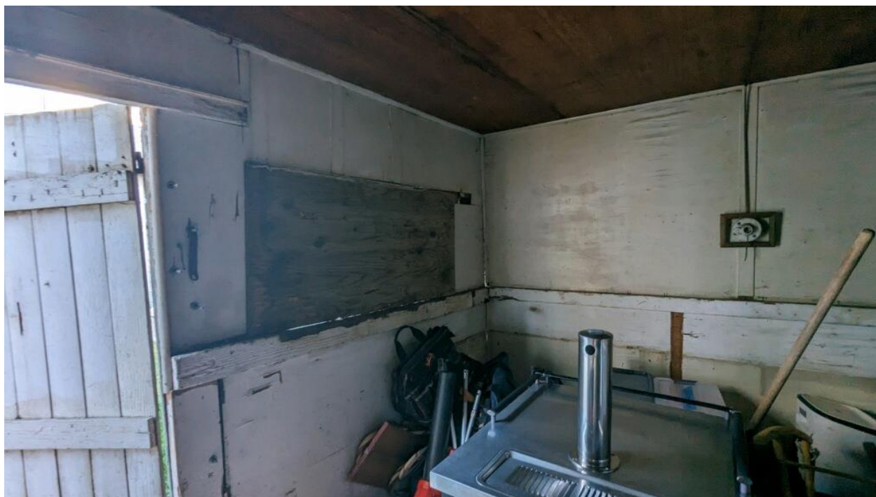
View looking southeast, interior.