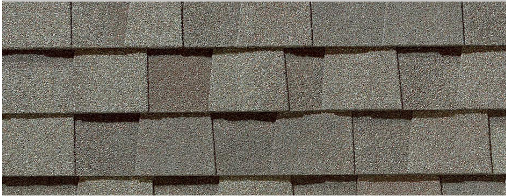
CertainTeed Landmark Roofing Shingles: Weathered Wood*