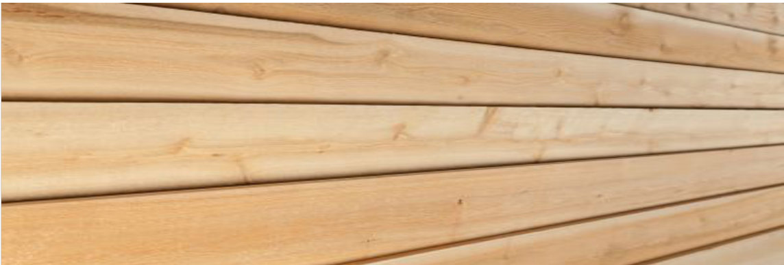
6" Exposure Wood Clapboard Siding: Cedar Select Tight Knot, Primed and Painted*