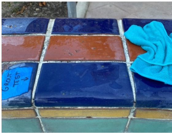
Select area of deteriorated grout before grout test.