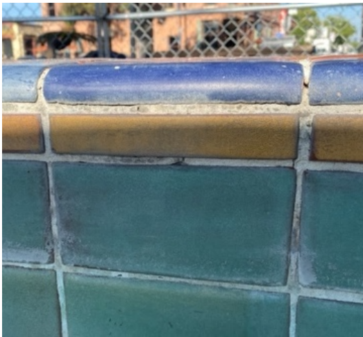
Area of west interior vertical surface after treatment with IBIX® system using sodium bicarbonate media.