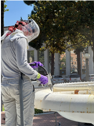
Detail of IBIX® testing in progress on upper fountain rim.