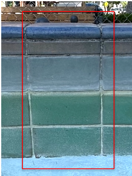
Area of west interior vertical surface before treatment with IBIX® system using sodium bicarbonate media.