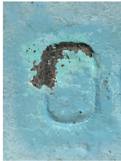
Select area of recess detail at blue lining after testing with IBIX® system.