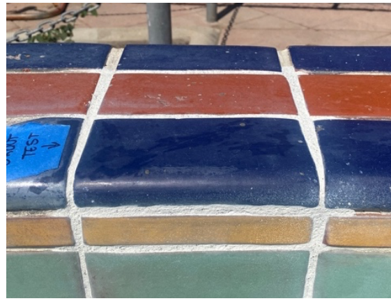
Select area after grout replacement test.