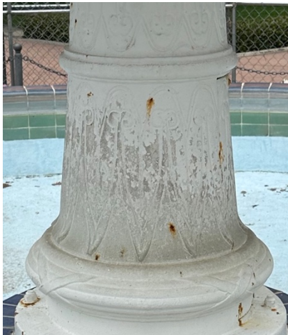
Detail of painted cast iron plinth with adhered and discolored mineral deposits as well as ferrous corrosion products emanating through the paint coatings and staining the surface.