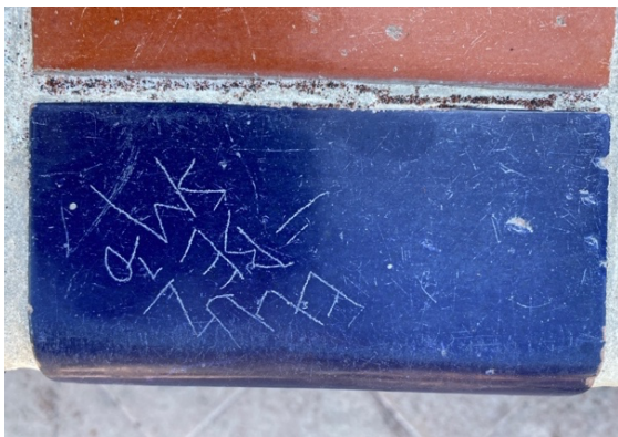
Overview of tile with incised graffiti before test 3 (in-painting and varnish).