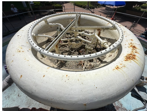
Overview of upper basin with ring of brass/bronze, PVC tubing, and ferrous metal supports.