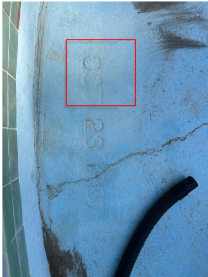
Select area of blue lining with mark in red of area before testing IBIX® system. Cracking in basin with associated material loss also visible.