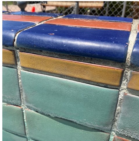
Area of west interior vertical surface after treatment with IBIX® system using sodium bicarbonate media followed by an additional pass with Stone Pro® Stone & Glass Scrub undiluted.