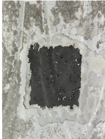
Select area of cast iron plinth after test of paint and corrosion elimination with IBIX® system with garnet media.