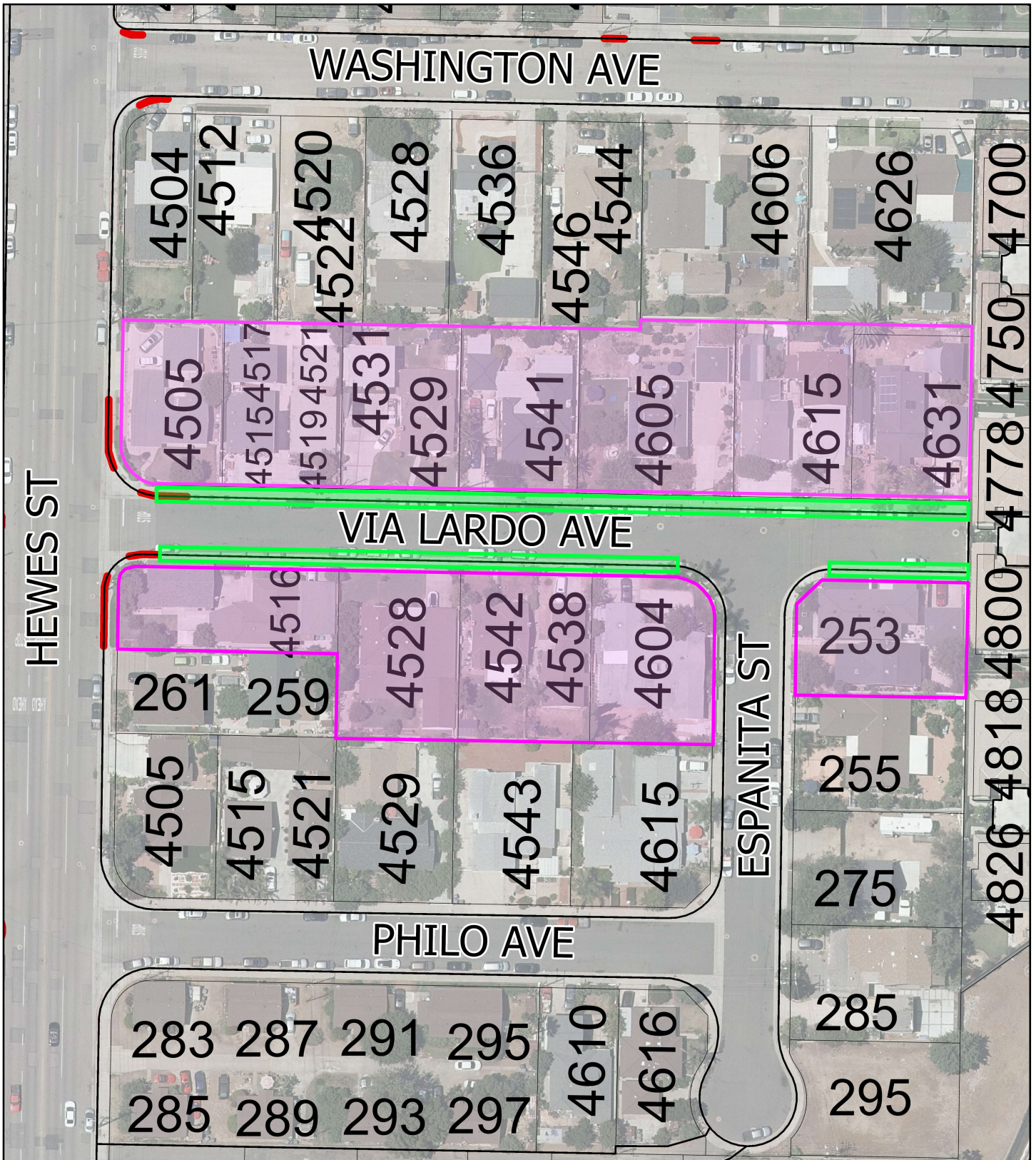
Item 4.2 Permit Parking Via Lardo Avenue