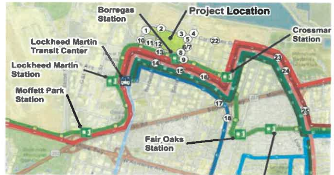
Map of Study Intersections and Transit Routes from the Google Campus TIA in Sunnyvale, CA.