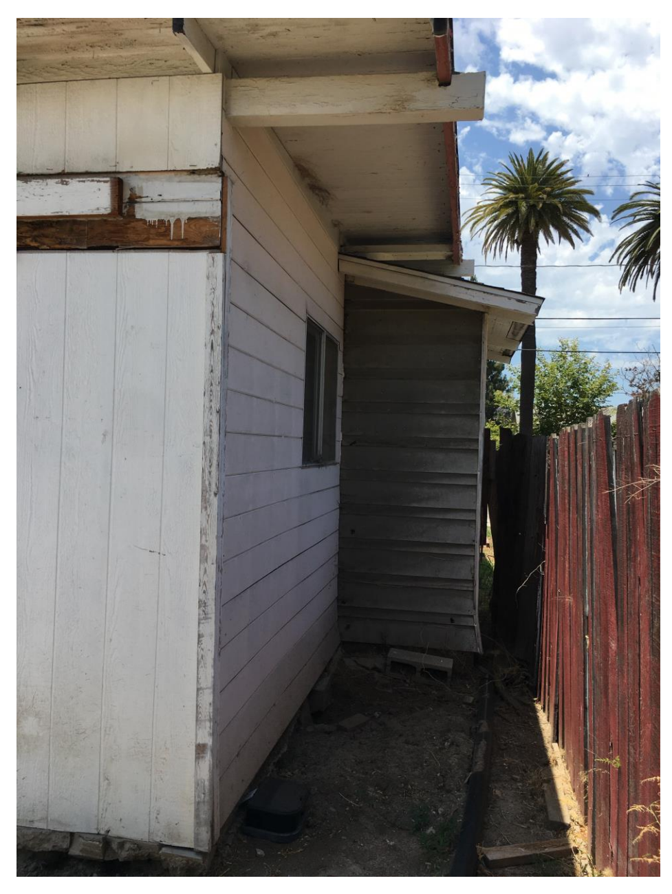
North Elevation looking West.