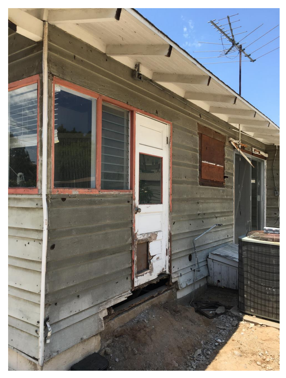
Rear (East) Elevation looking Northwest.