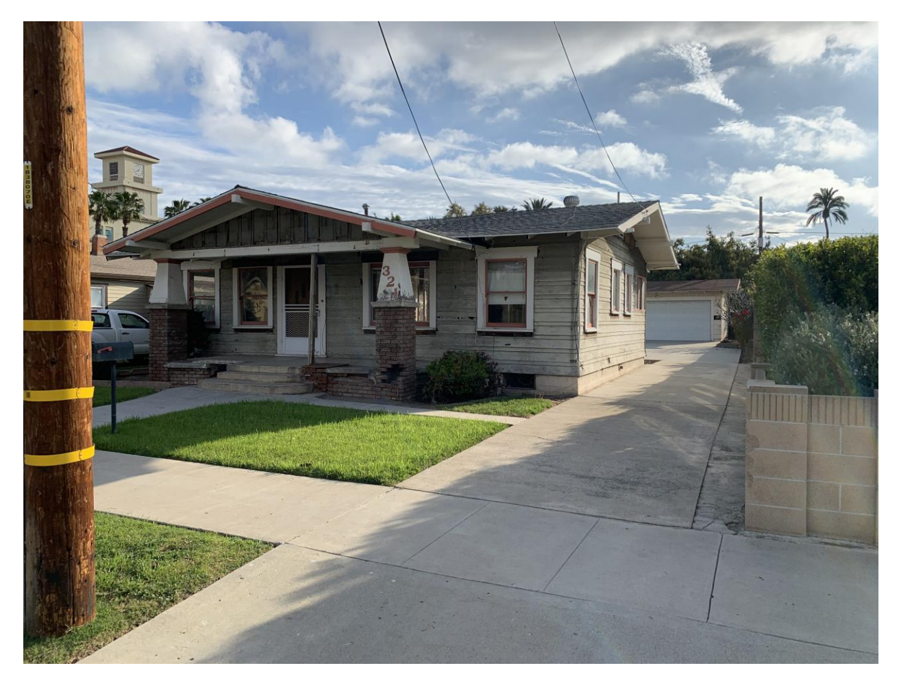
321 N. Olive Street, West Elevation looking northeast.