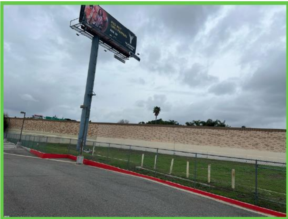
East adjacent properties - Vacant land followed by Costa Mesa Freeway