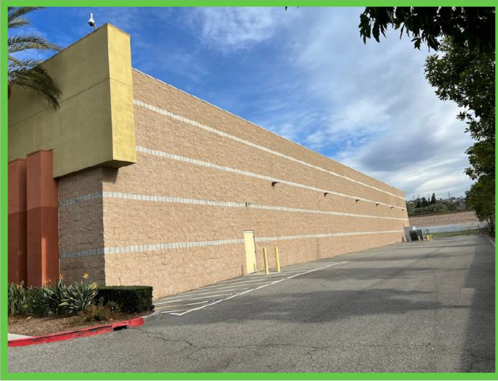
3) South elevation