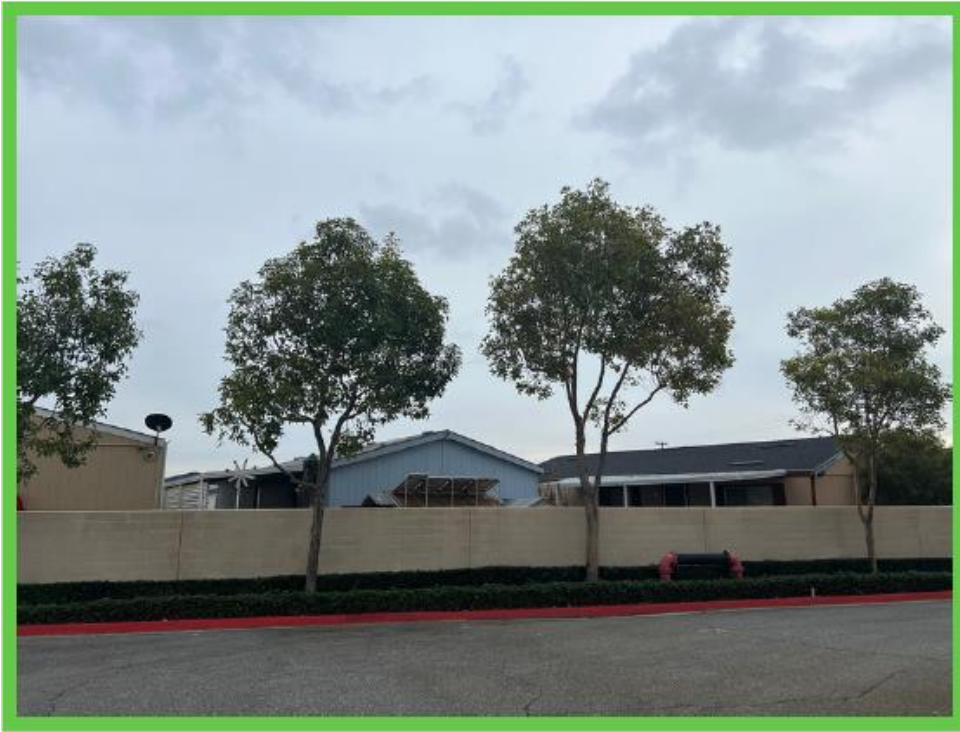
South adjacent property - Orange Mobile Home Park