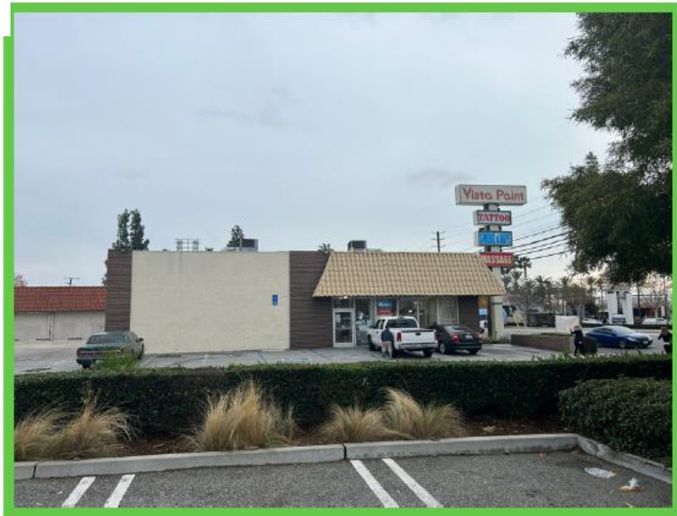
South adjacent property - Multi-tenant commercial office/ retail building