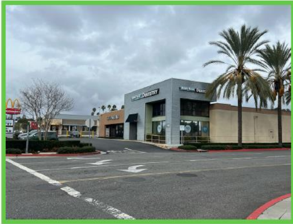
North adjacent property - Multi-tenant commercial office/retail