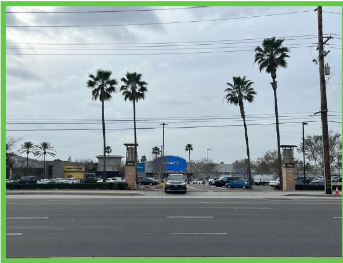
West adjacent property - Walmart