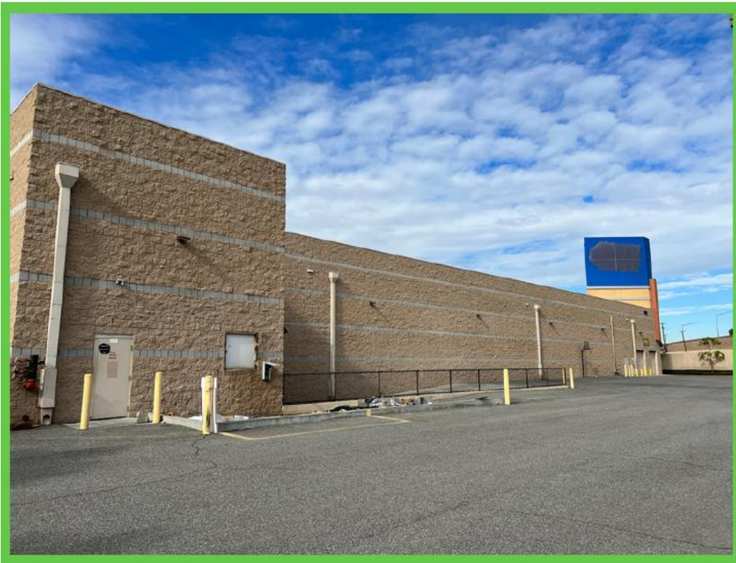
4) East elevation