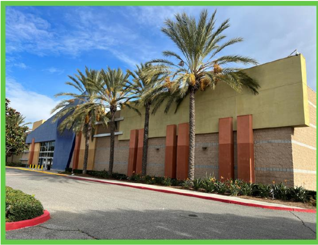
5) West elevation