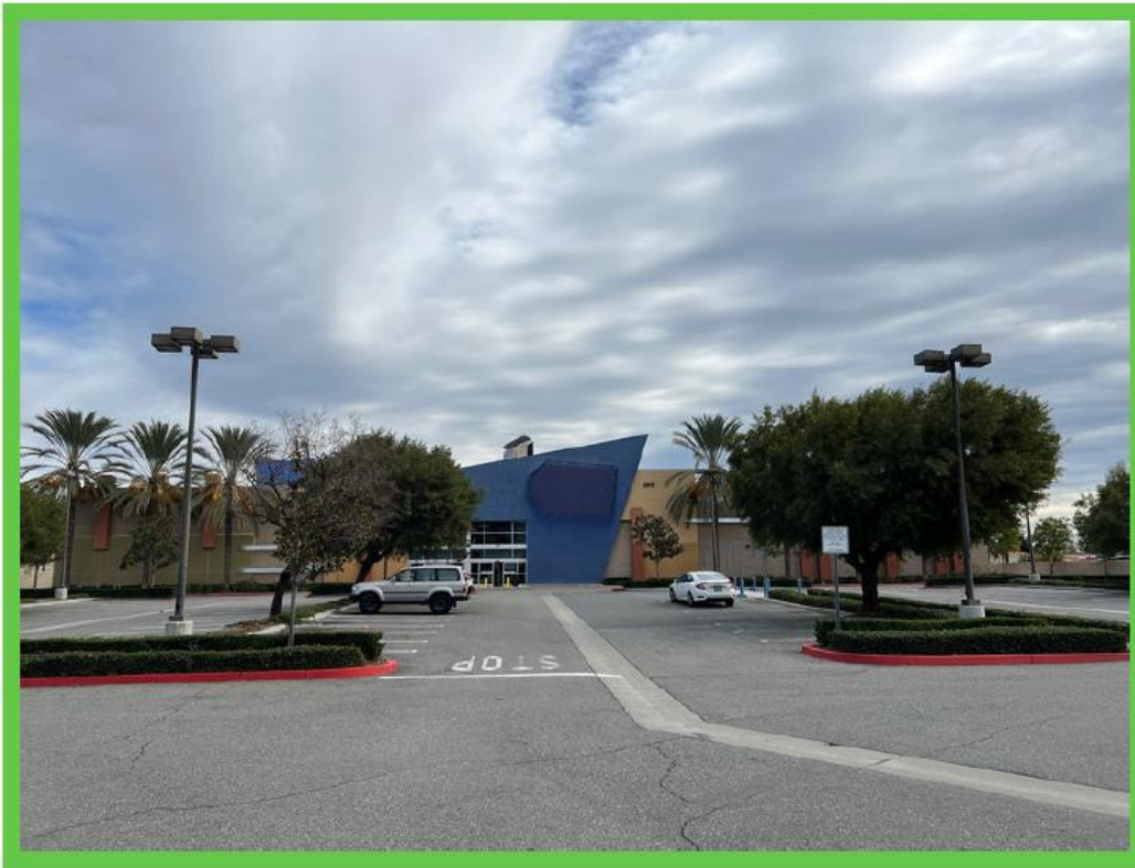
1) Front view of Subject Property