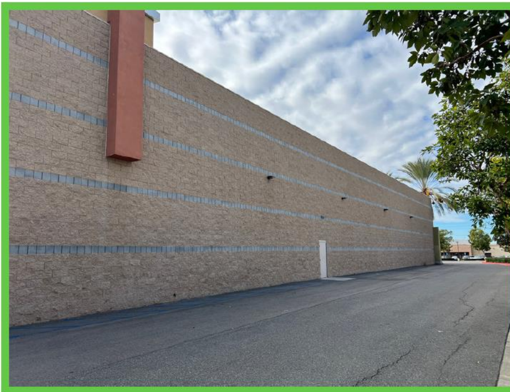
2) North elevation