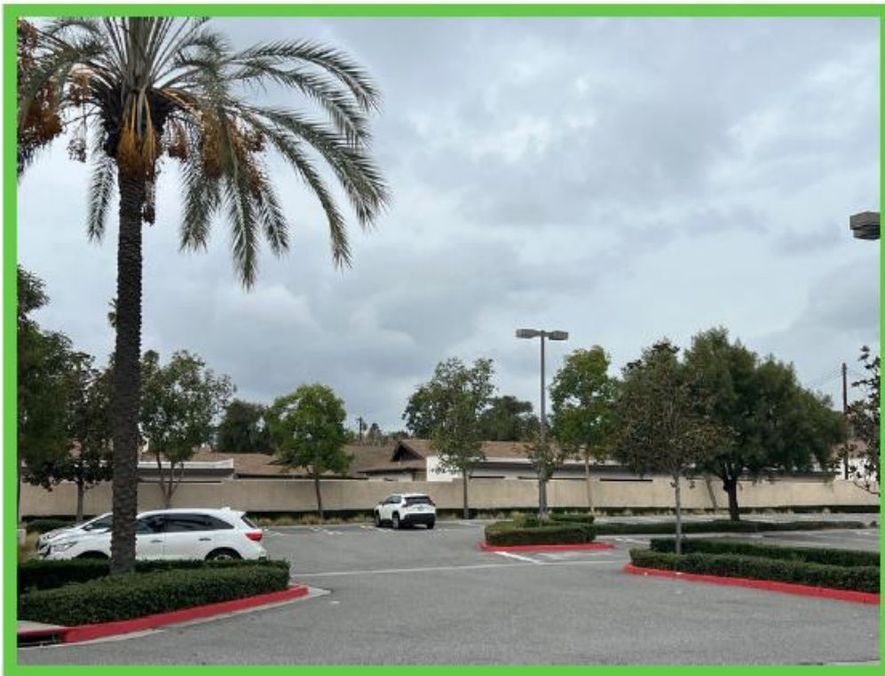
North adjacent property -Park 72 Condominiums