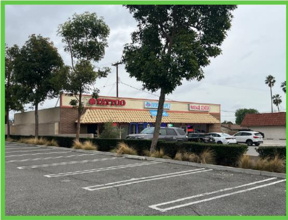
South adjacent property - Multi-tenant commercial office/ retail building